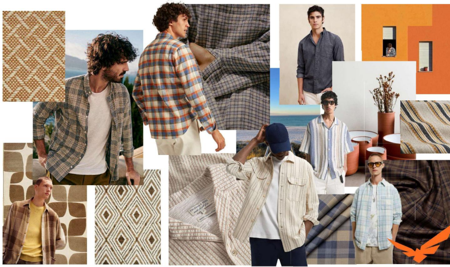
Pantone 10-1318 TCX Warm Taupe